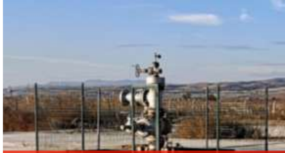
ITALY, TURKEY, CROATIA – RESOURCE ASSESSMENT