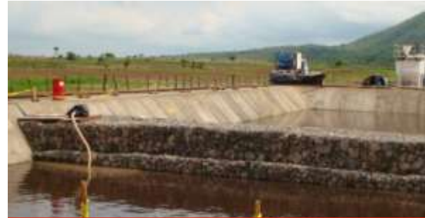
DJIBOUTI – ARTA GEOTHERMAL PROJECT DRILLING PROGRAM