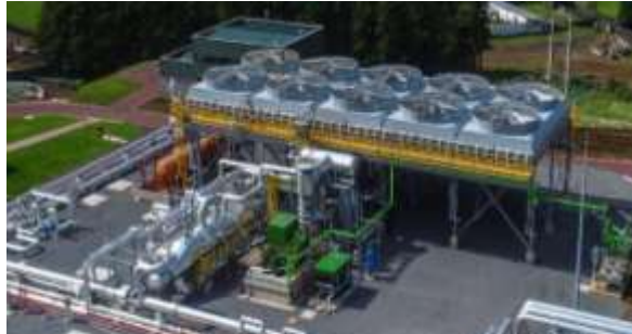
FRANCE, AZORES, TURKEY – BINARY GATHERING SYSTEM