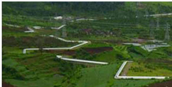
INDONESIA, MOZAMBIQUE - GEOCHEMICAL CONSULTANCY