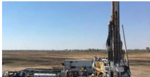
ITALY – 2 GRADIENT WELLS DRILLING SUPERVISION