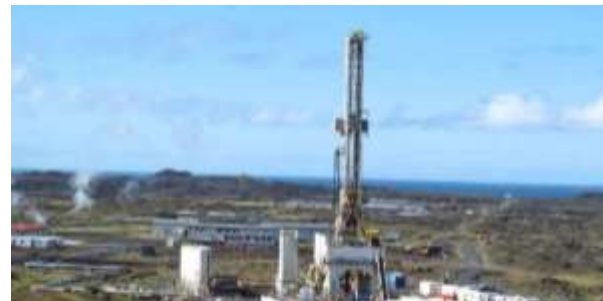
ITALY – TENDERING PROCEDURE FOR DRILLING CONTRACTING