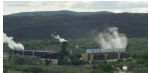
KENYA – MENENGAI I + OLKARIA I-U6 WELLS/GATHERING SYS.