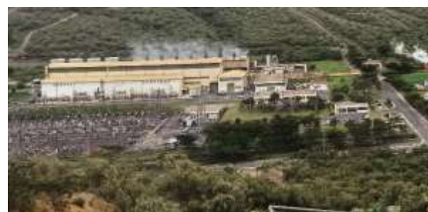
KENYA – MINERAL EXTRACTION FROM GEOTHERMAL BRINE