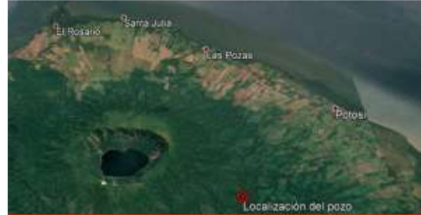
NICARAGUA - VOLCAN COSIGUINA GEOTHERMAL