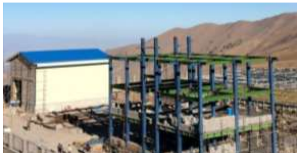
IRAN – 5 MW SABALAN FLASH PLANT