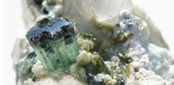
ITALY – LITHIUM EXTRACTION PROJECT