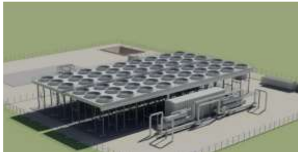
ITALY - SEVERAL ZERO- EMISSION BINARY PLANTS