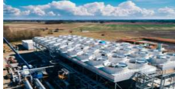
CROATIA – 17 MW VELIKA CIGLENA BINARY PLANT