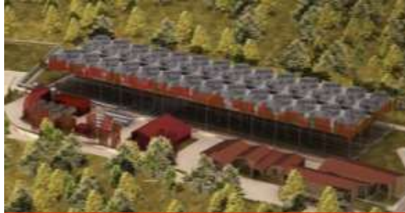
ITALY – SORGENIA 5 MW SARAGIOLO BINARY PLANT